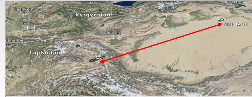
GBAO to Xianjiang- 550 Miles