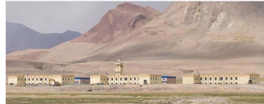
Chinese Base Reported on 19 Feb – Shaymak