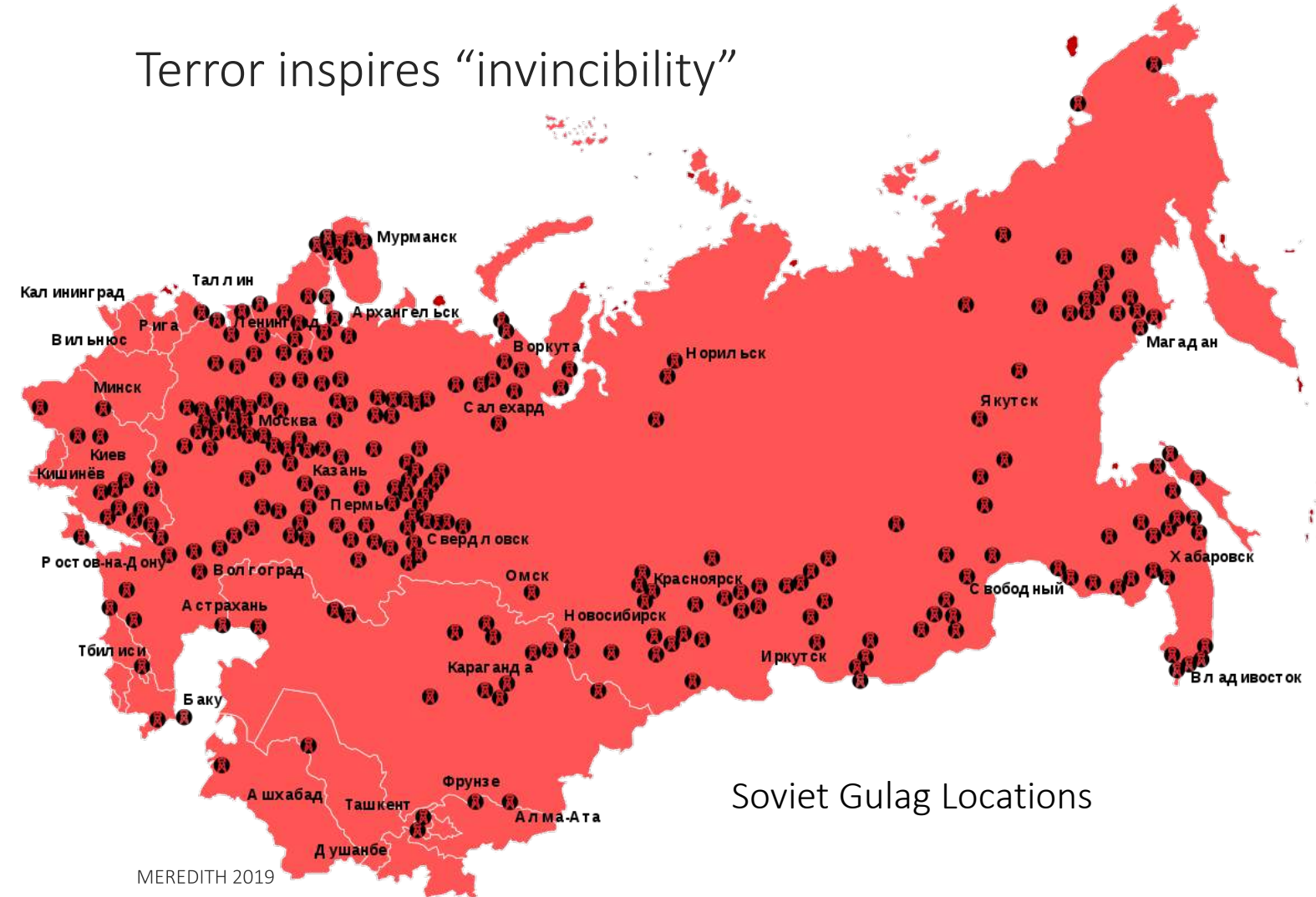
Soviet Gulag Locations