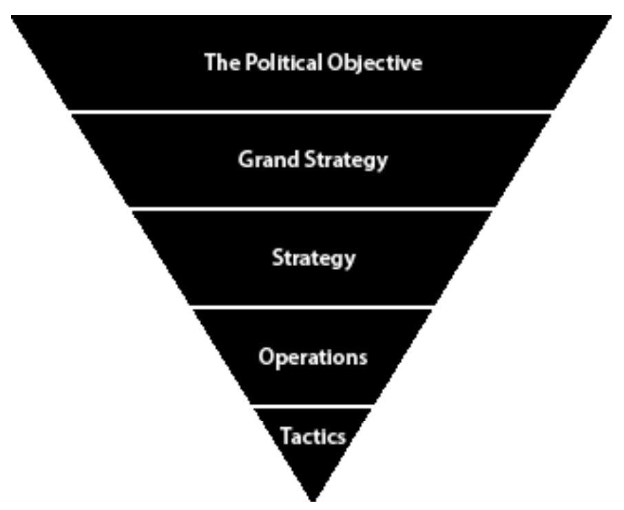
FIGURE 1 THE RELATIONSHIP BETWEEN THE POLITICAL OBJECTIVE AND THE USE OF POWER

A way to conceptualize the relationship between the political objective and how a state uses its power to obtain that objective is to view these elements as distinct but interrelated realms. The graphic below is presented as an analytical tool. We start with the political objective, or the political aim. As Clausewitz, Corbett, and other theorists make clear, nations and peoples go to war for political