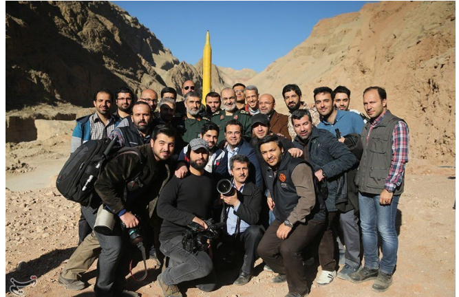
Figure 2: IRGC Missile Exercise, eastern Alborz heights, March 10, 2016

However, Bidwell does not consider Iran's more sophisticated mid-range missiles to be ready to go online. This view is not entirely shared by Connell, who notes that a few, such as the Qiam, used by Iran and the Houthis have been fairly accurate, and the LACMs used in the attacks on Saudi infrastructure were highly accurate. Consequently, the technical motivation for testing remains, while the domestic and international signaling function has been eclipsed by Iran's battlefield deployment. As a result, publicizing tests became less important after 2017 and, by early 2018, the risk inherent in drawing any attention to its missile program became evident (Taleblu).